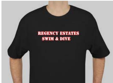
Swim and Dive Team T-Shirt $12