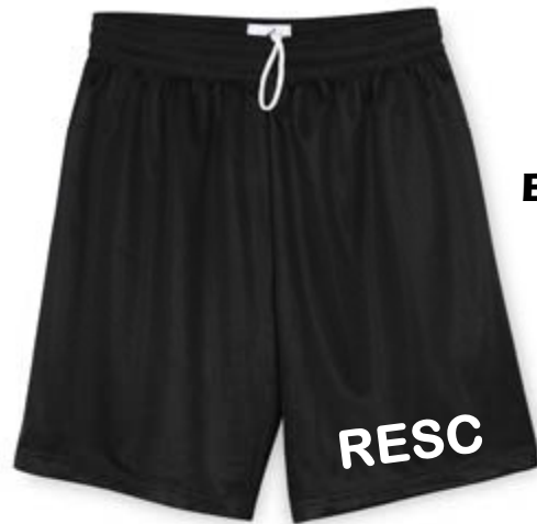
Boys Mesh Shorts $17