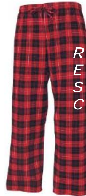
Flannel Pants $22