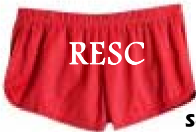
Soffee Shorts $12