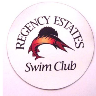
Car Magnet $3