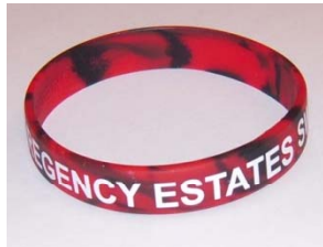
Regency Estates Swim Club Wristband $1