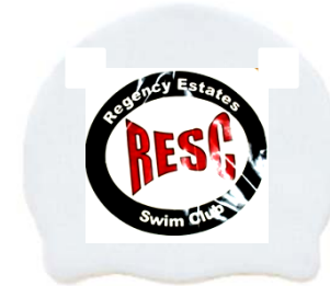
Silicone Swim Cap $12